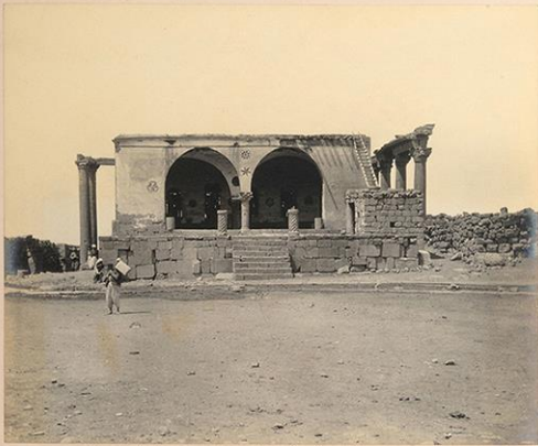
Ancient temple, west of Hufays, Moab.