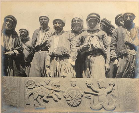
Group of Druze with ancient carving, Amman.