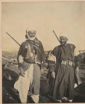
Two men and with us of Hadj Ali's