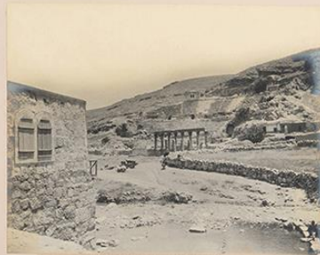
North Wall of Machaerus - June 1897