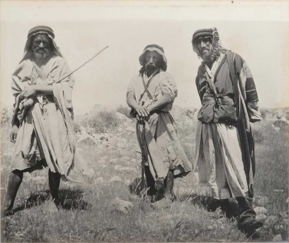
Bedouins of Machaerus.