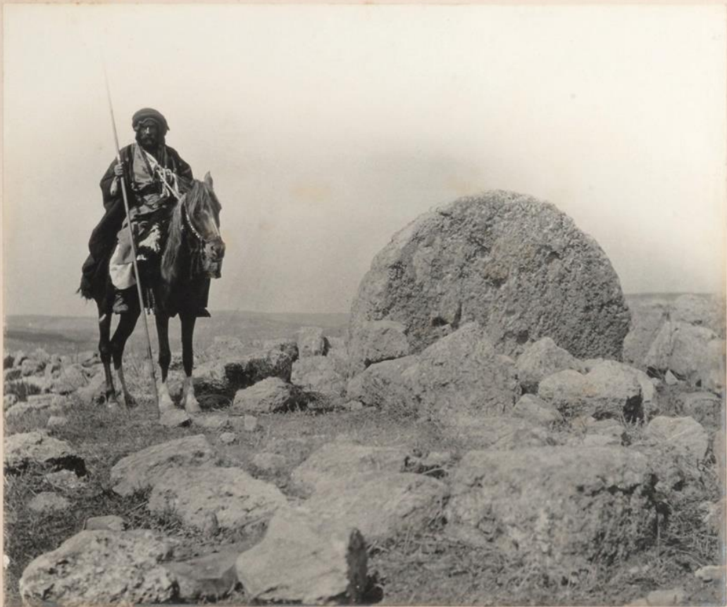
East of Hufays, on the plain of Moab.