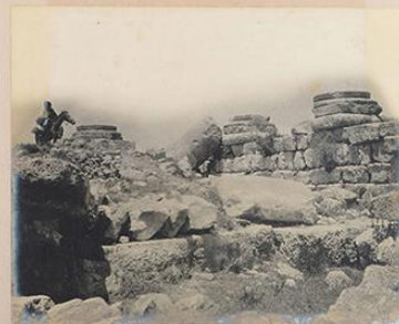
East Wall of Machaerus - June 1897