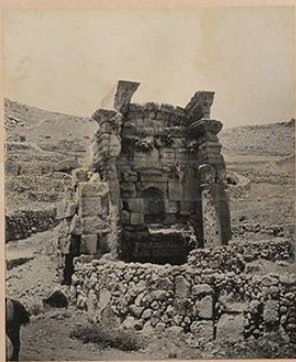
South Wall of Machaerus - June 1897