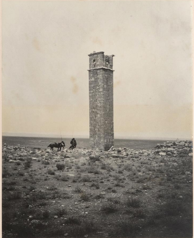
Tower of Amman, Amman.