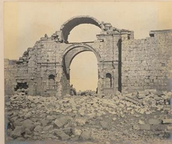
Remains of a house